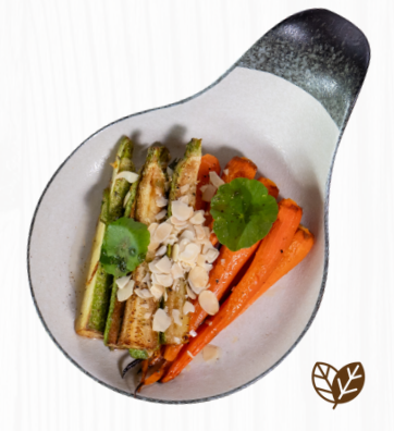
Sautéed Baby Carrot & Zucchini 190 THB