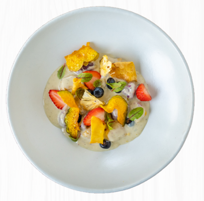
Pumpkin & Sweet Potato Gnocchi

Handmade potato gnocchi with Thai four-cheese sauce, fresh strawberry, blueberry, and crispy sweet potato