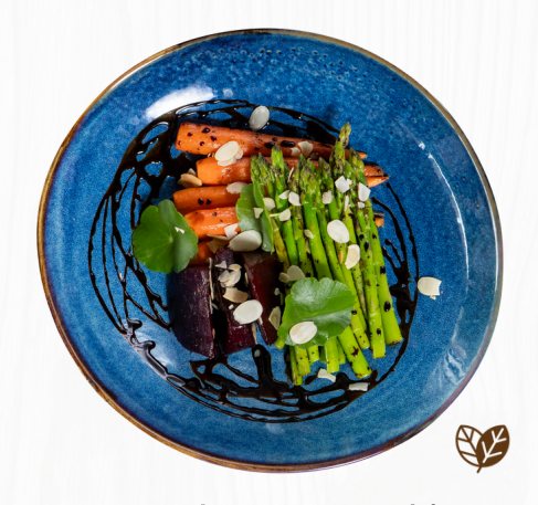
Roasted Root Vegetable Slow roasted organic vegetable, mulberry reduction