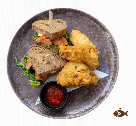
Smoked Salmon Brown bread, smoked salmon, caper cream cheese, cucumber roll, dill, black caviar, and French fries