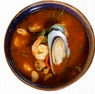
Andaman Seafood Soup

With Hairloom tomato, Thai sweet basil and prawn broth