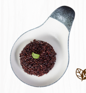
Sisakate Steamed Rice Berry 100 THB