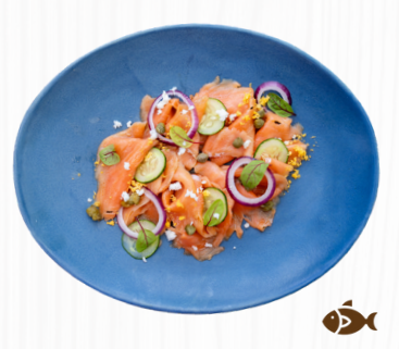
Smoked Salmon Plater

With caper, thinly sliced red onion, lemon wedges, sliced cucumbers and yogurt dill dip