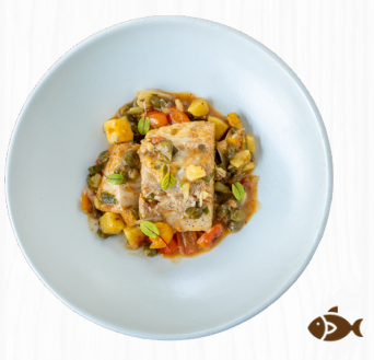
Phuket Andaman White Snapper

Grilled white snapper with Mediterranean white wine sauce