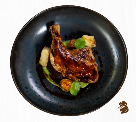
Roasted Chicken Leg Phuket farm roasted free-range chicken leg, organic broccoli puree, roasted potato, and Chang beer chicken jus 690 THB