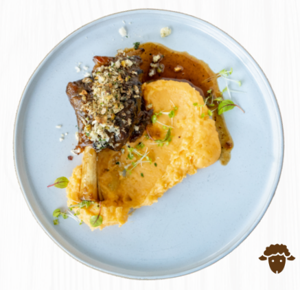
Double Stew Lamb Shank With orange mashed potato and pistachio gremolada