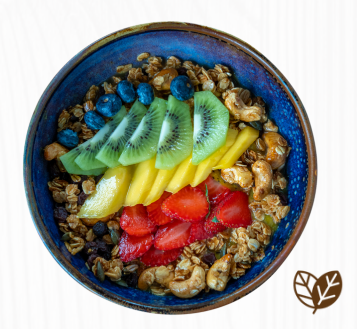
Open Kitchen Super Bowl Passion fruit & Mango smoothie mixed with seasonal fruits and