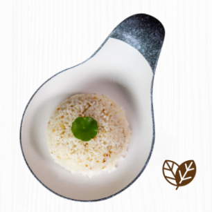
Gaba Hom Garlic Butter Rice 100 THB