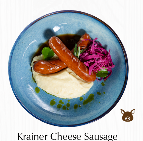
Grilled pork cheese sausage served with SEED Farm garlic mashed potato, pickle red cabbage, and caramelize onion pork jus