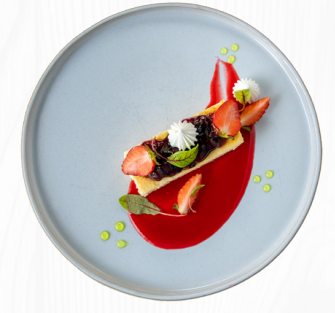
Chiang Mai Strawberry Cheesecake 390 THB