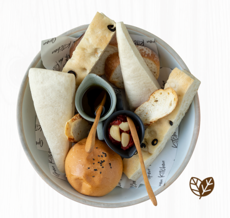
Bread Bowl butter, and sundried tomato dip