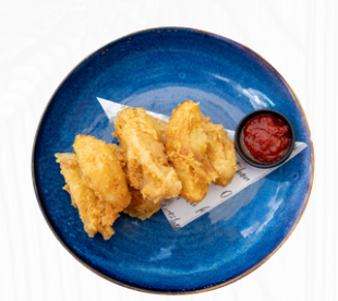
Homemade French Fries 190 THB