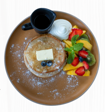
Coconut Buckwheat Pancake

With fresh fruit, honey, and whipping cream