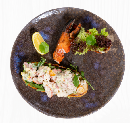
Phuket Lobster Roll With freshly squeezed lemon juice, chives, fresh parsley, celery and buttered buns toasted