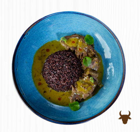
Green Curry Beef Cheek Slow cook Thai beef cheek in green curry, Sisaket riceberry