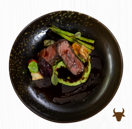
Thai Wagyu Charcoal grilled Thai Wagyu beef tenderloin, with green pea puree, honey glazed roasted baby carrot, smoked sea salt, and bone marrow double beef jus