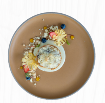
Phuket Pineapple Crumble Tart 375 THB