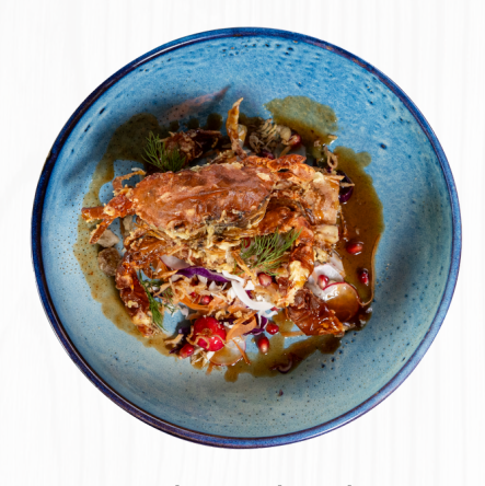
Poo Nhim Mha Kham Golden crispy fried soft shell crab with tamarind sauce