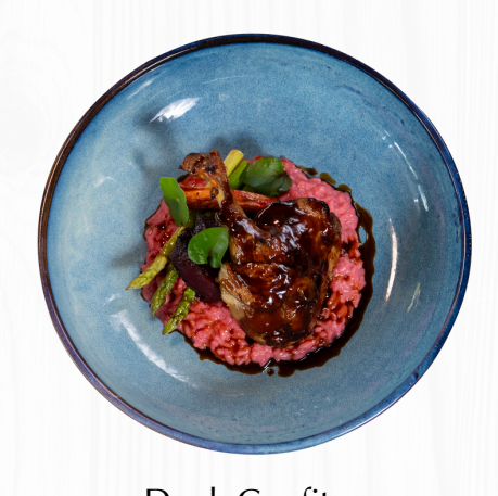
Duck Confit Slow cooked homemade duck confit served with organic beetroot risotto with Thai four cheese and Mekong Thai whisky duck jus