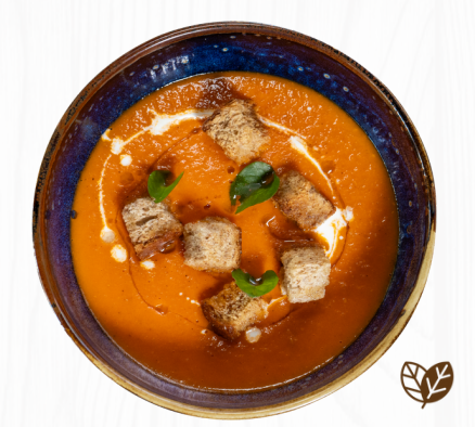
Open Kitchen Roasted Tomato Soup