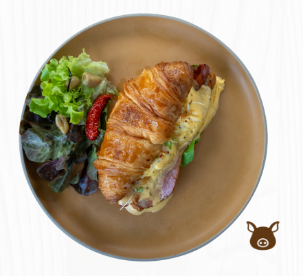
Croissant Egg Benedict Croissant, black ham, rocket salad, poached eggs, and béarnaise sauce