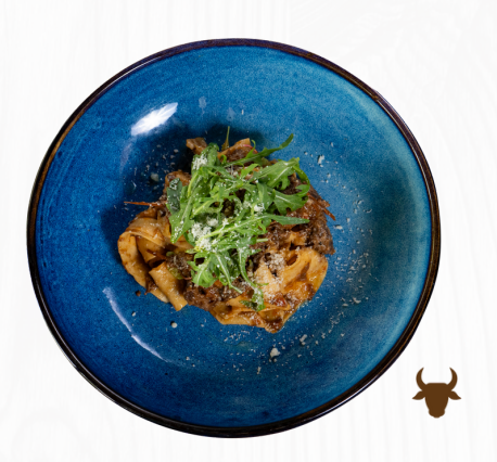
Pappardelle Thai Wagyu Beef Ragu

Pappardelle with Thai Wagyu beef ragu, parsley, and parmesan