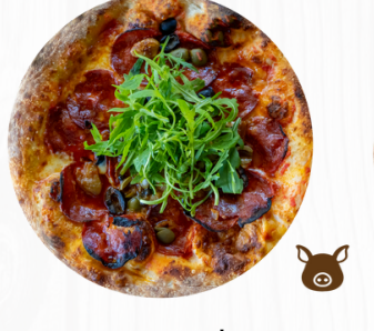
Open Kitchen Chorizo Pizza

With Chorizo, rocket leaves, black olive and confit garlic