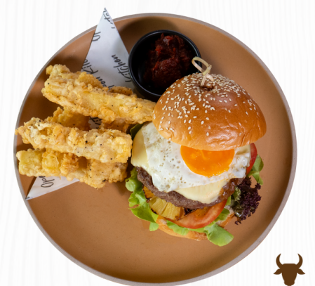
Open Kitchen Burger arcoal grilled beef burger, with SEI

Charcoal grilled beef burger, with SEED Farm Thomas tomato, Karprow cheese, egg, grilled Phuket pineapple and French fries