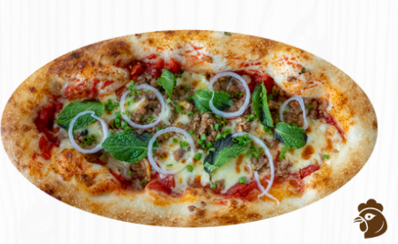
Long Pizza Lab Gai Kapro

Spicy minced chicken salad with roasted rice powder and Thai Kaprow cheese