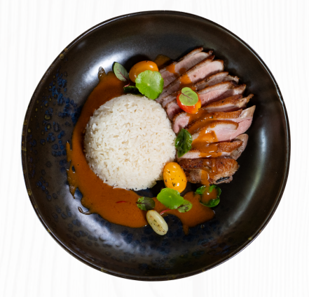
Geang Phed Ped Yang Grilled Thai duck breast with creamy red curry serve with GABA Hom Mali rice and garlic butter