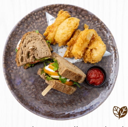
Tomato and Mozzarella Sandwich

Charcoal grilled beef burger, with SEED Farm Thomas tomato, Karprow cheese, egg, grilled Phuket pineapple and French fries