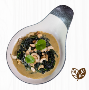
Creamy Spinach, Phuket Cashew Nut 190 THB