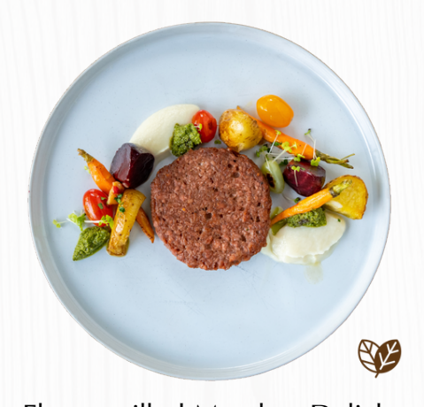
Flame-grilled Meatless Delight Grilled Plant-Based Burger Patty, with garlic puree, and roasted Seedling farm root vegetable