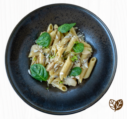
Spinach and Mushroom

Penne pasta, organic baby spinach, wild mushroom, and pine nut