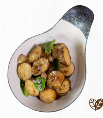
Duck Fat Roasted Baby Potato