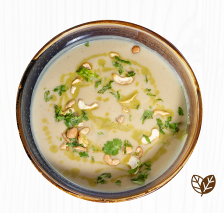
Curried Thai Coconut Cauliflower Soup

Creamy cauliflower with Thai green curry, coconut milk, cilantro, and peanut