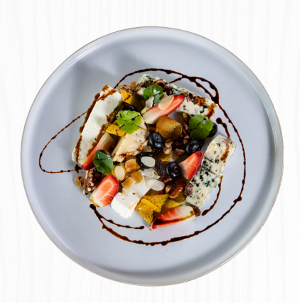
Open Kitchen Cheese Platter

Vanity of amazing boards Chiang Mai cheese with homemade jam, green olive tapenade and biscuits