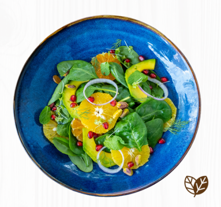
Citrus Avocado Salad

With organic shallot, dill, mint, pistachio, pomegranate, and honey mustard dressing