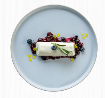
Open Kitchen Blueberry Panna Cotta 375 THB