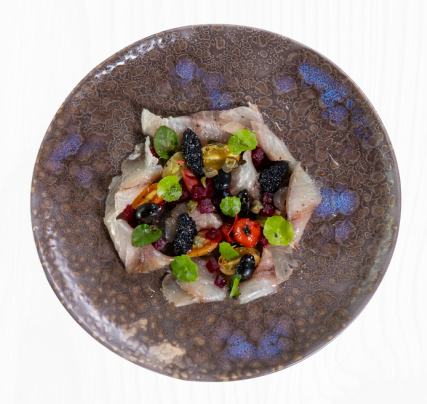
Twice Cured Brown Marbled Grouper

Homemade cured sustainable brown marbled grouper with smoked SEED Farm pickled beetroot carpaccio, dried cherry tomato, caper berries, caviar, and honey, lemon, mustard, and ginger vinaigrette