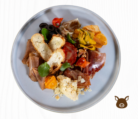
Open Kitchen Grazing Board

Chiang Mai cheese, cold cut, almond hummus dip, organic beetroot dip, watermelon arugula salad, fattoush salad, grissini, and biscuits