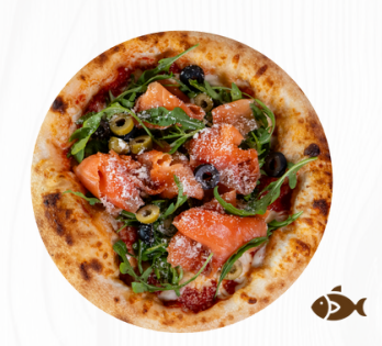
Smoked Salmon Pizza

With Thomas tomato, mozzarella cheese and basil