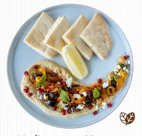
Mediterranean Hummus Organic hummus, tomato salsa, green and black olive, pita bread