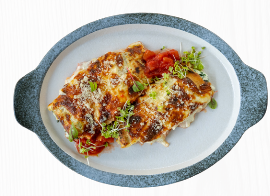
Chiang Mai Ricotta Cannelloni

Handmade bake spinach and ricotta cannelloni with béchamel and homemade tomato sauce