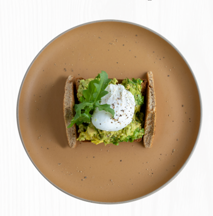
Avocado Toasted With sourdough bread, avocado, poached egg, and rocket leaves