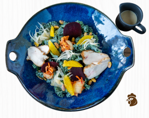
Young Kale& Fennel Salad

With beetroot candy, SEED Farm cucumber kimchi, orange, grilled Cajun chicken, almond and lemon Tahini dressing