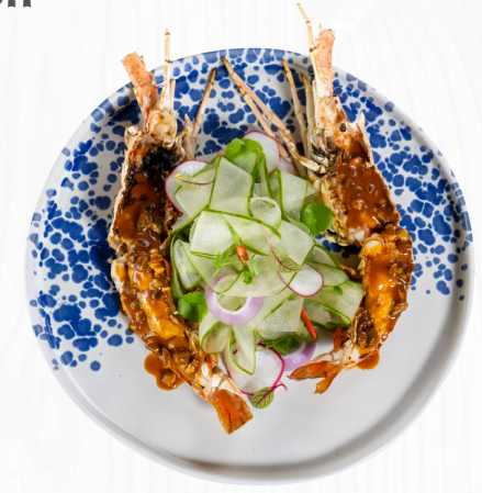
Grilled Phuket Lobster Marinated with coconut curry served with peanut sauce and cucumber relish 1,890 THB